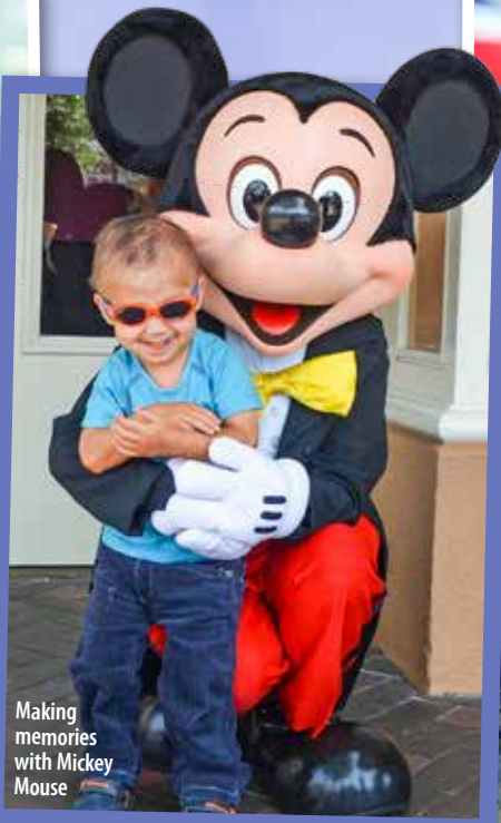
Making memories with Mickey Mouse